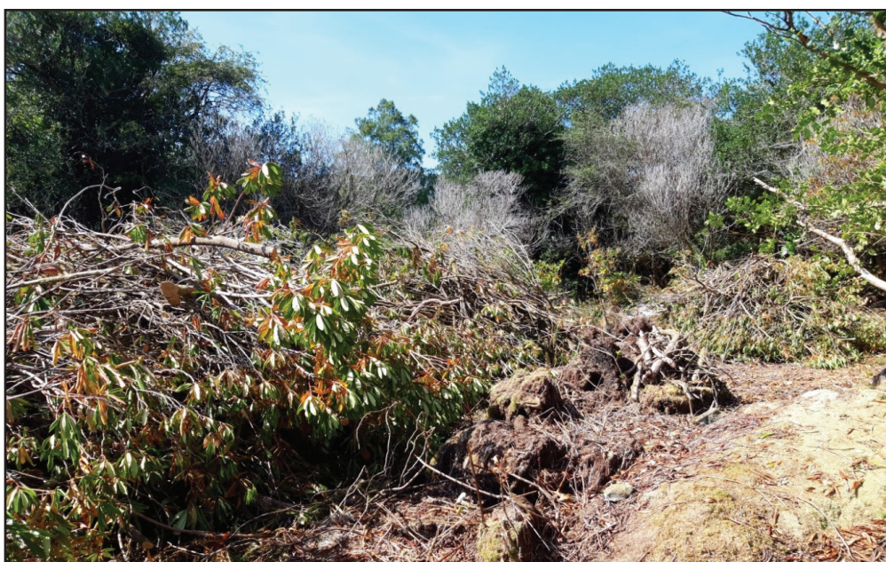
Figure 2. Brash piles created from dense Rhododendron thickets.

Being aware that many farmers depend on off farm employment as an income support, farmers do not have adequate time to carry out labour intensive work on the land, in conjunction with the fact that some of the work was too onerous for an individual were challenges initially for the project. However, this was overcome by building skills locally through the development of 'collective groups'. These collective groups are local farmers and local people who obtain the necessary training required to carry out work on behalf of participating farmers, as self-employed contractors, supervised by the project team while carrying out necessary work. This ensures that skills are developed locally and capacity is built upon. This is more sustainable in the long term and has resulted in a positive rural development from a strong economic and social return to people living in the area, not only the participants of the project.