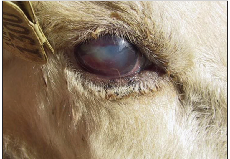
Figure 4. Early uveitis cloudiness on cornea

Listeriosis causing encephalitis in the brain which occurs primarily in the winter-spring period and is largely a disease of housed sheep. The less acidic pH of spoiled silage enhances multiplication of Listeria Monocytogenes with outbreaks typically occurring around ten days after feeding poor-quality silage. Listeria is a zoonosis causing disease in humans where mortality can reach 50% in infected cases. This reinforces the need for fresh gloves, disposable aprons, good cross infection control and the use of disinfectants when treating eye conditions in sheep, or indeed lambing ewes.