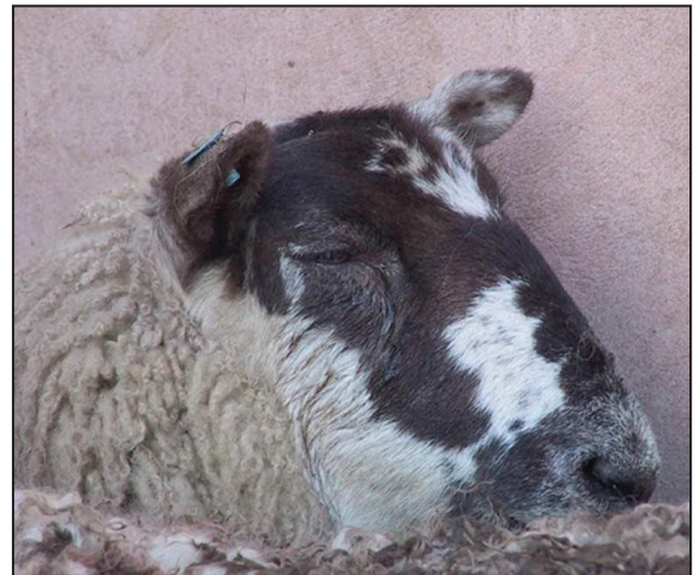
Figure 1. Early signs of pink eye: a closed eye and tear staining of the cheek

Infectious keratoconjunctivitis tends to spread rapidly within a flock if animals are housed or being fed over winter in proximity. Appetite will be depressed because of ocular discomfort and visual disturbance will occur with a resultant inability to locate food. The disease progresses from mild conjunctivitis to ulceration and potentially permanent loss of the eye with temporary or permanent blindness. A few causative agents have been suggested which are all bacterial. One bacteria, Mycoplasma conjunctivae , is considered the major primary cause, but several other bacterial species are suggested as causative agents. This disease can be difficult to treat and control both at an animal and flock level, so best practice is to isolate any cases as soon as they are identified and treat affected animals immediately.