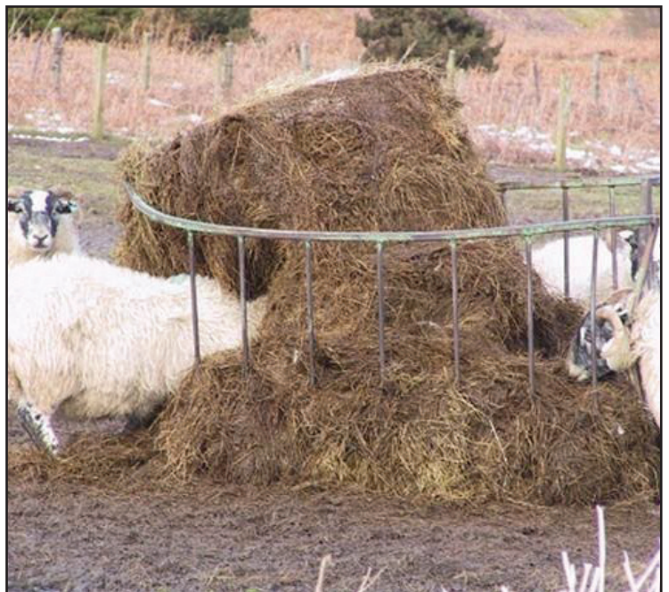
Figure 6. A classic cause of silage eye