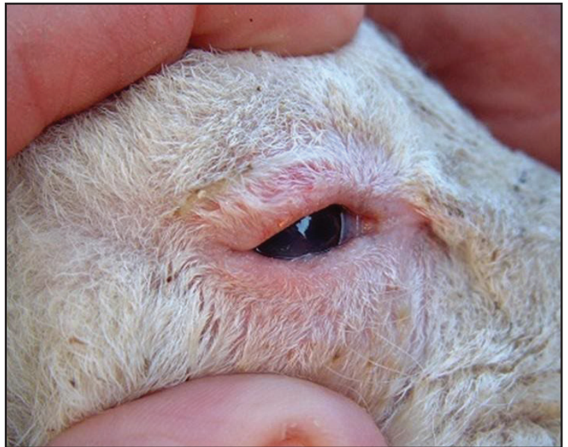
Figure 7. Entropion in a Lamb

There is a good response to treatment, in simple cases the lower eyelid is everted by rolling down the skin immediately below the lower eyelid. A topical antibiotic can be in an ophthalmic ointment which is applied to the cornea to control potential secondary bacterial infection. In addition, this also lubricates movement of the lower eyelid thereby reducing the likelihood of inversion. If eyelid inversion recurs after rolling out the lower eyelid, subcutaneous injection