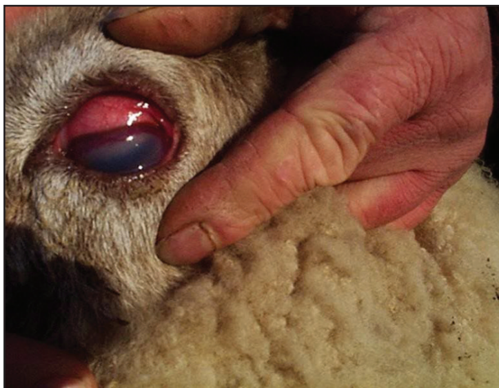
Figure 2. Brick red conjunctiva in an animal infected with pink eye

Separation of infected animals is recommended where possible. Temporary isolation is a basic biosecurity measure and is indicated to minimise the spread of this condition. Gloves and protective clothing should be worn and then disinfected or disposed of between animals when affected individuals are being handled.