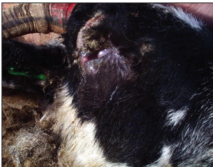
Figure 3. Rupture of the cornea requiring veterinary treatment to perform third eyelid surgery