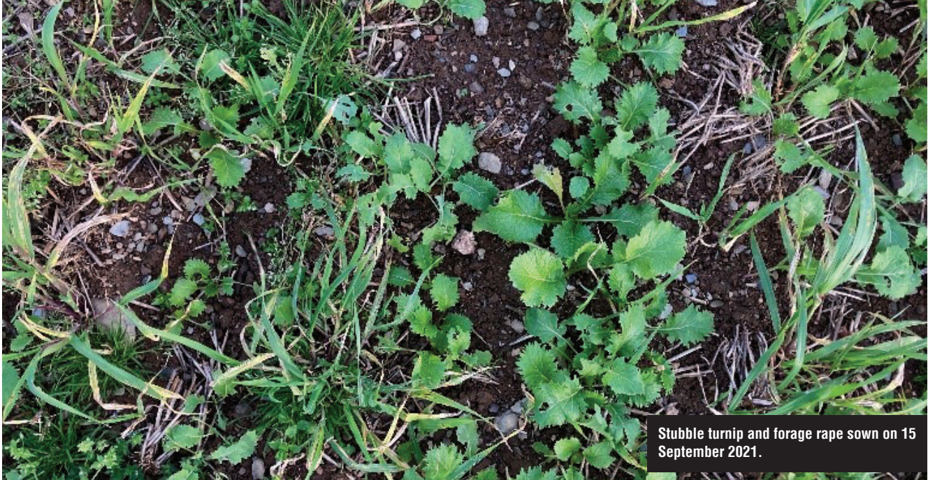
Stubble turnip and forage rape sown on 15 September 2021.