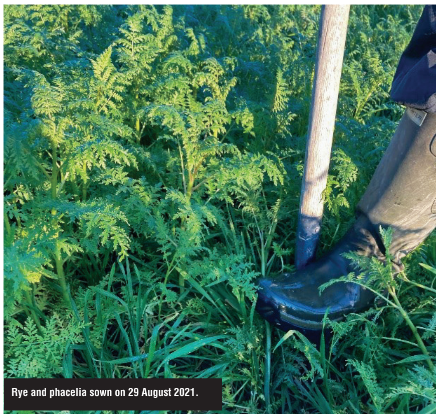
Rye and phacelia sown on 29 August 2021.

Figure 1 shows that for a cover crop sown in mid August, 54kg N/ha was recovered, while for the mid September, sowing date N uptake was reduced to 9kg N/ha.