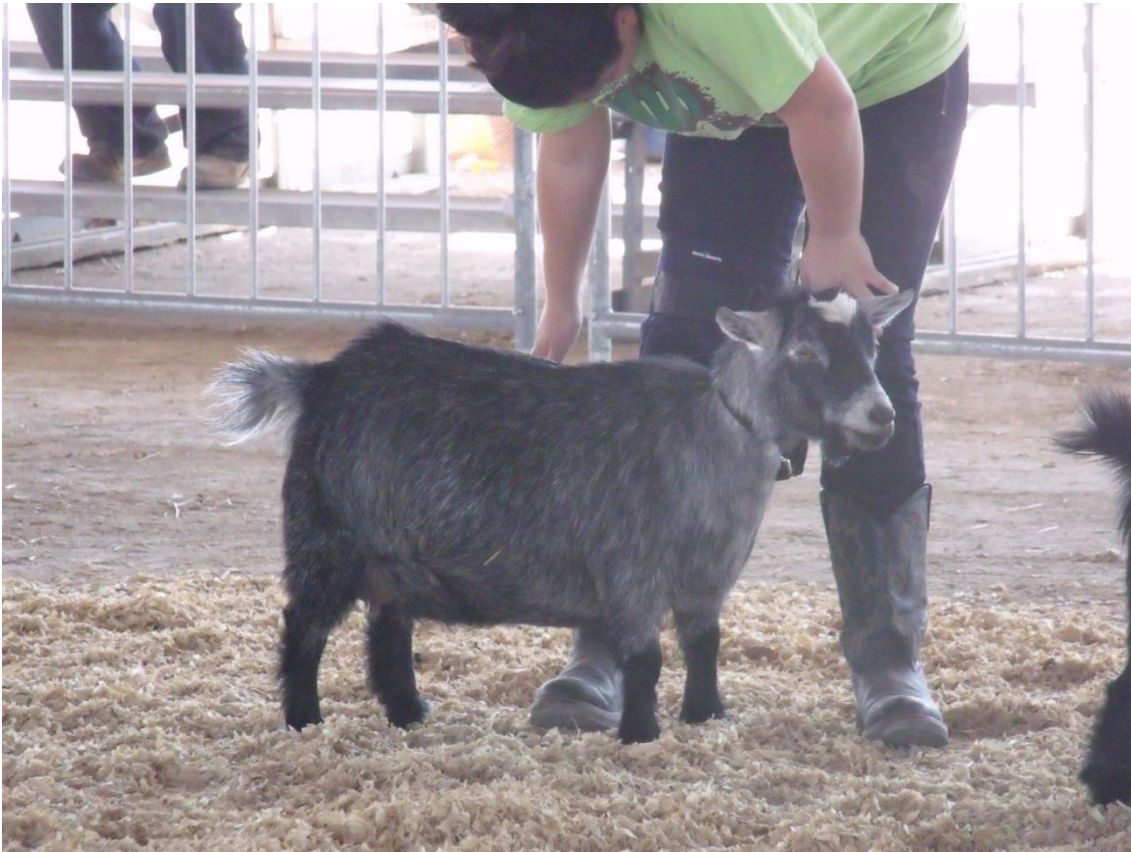
Figure 7. A Pygmy goat in the show ring.

Originally from West Africa, this hardy breed is typically kept as a pet but can be used for milk production.