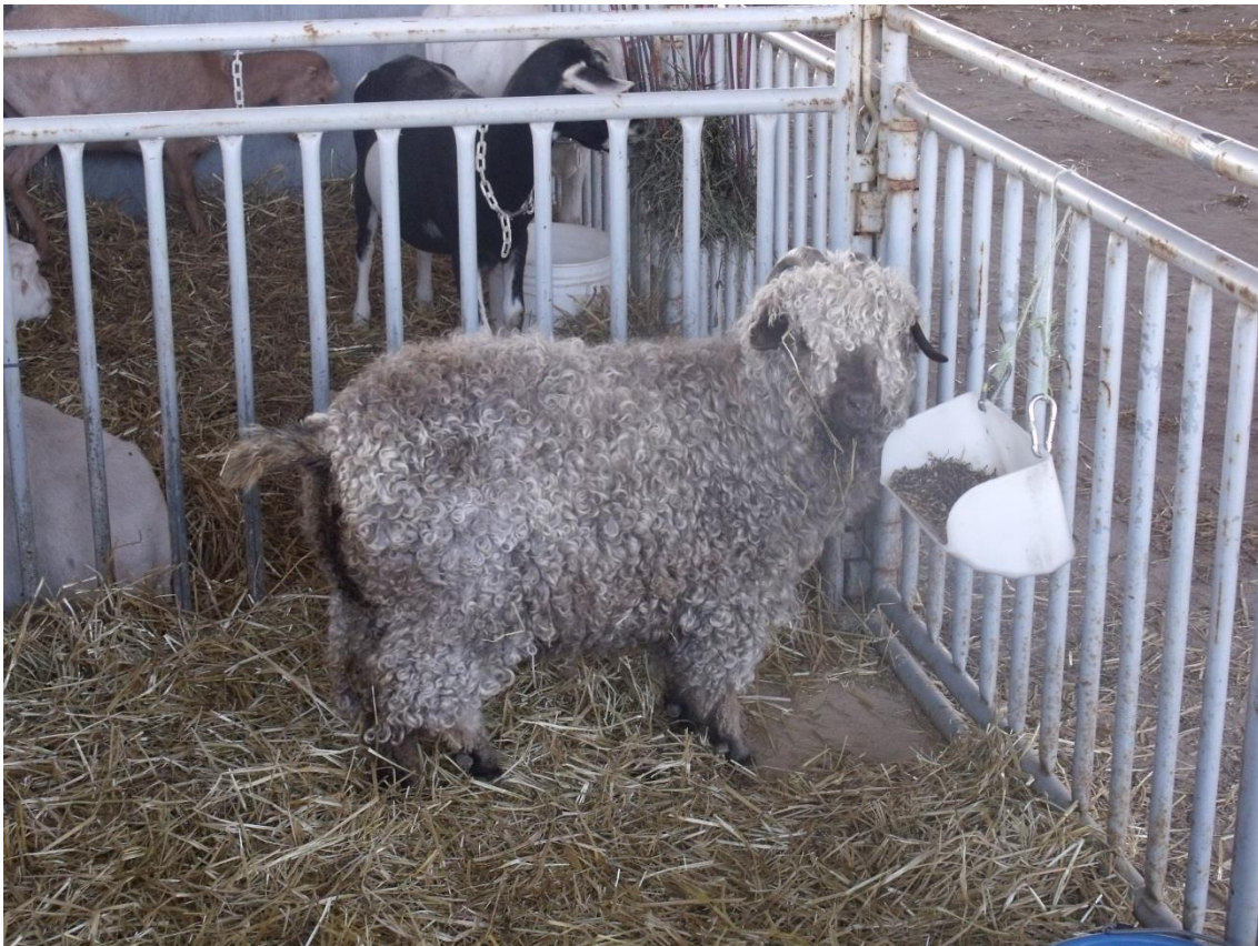
Figure 10. Cashmere goats are primarily used for fibre production.

Immediately recognizable by their name, any goat that produces cashmere wool is referred to as a cashmere goat. Breed standards vary regionally even in the United States.