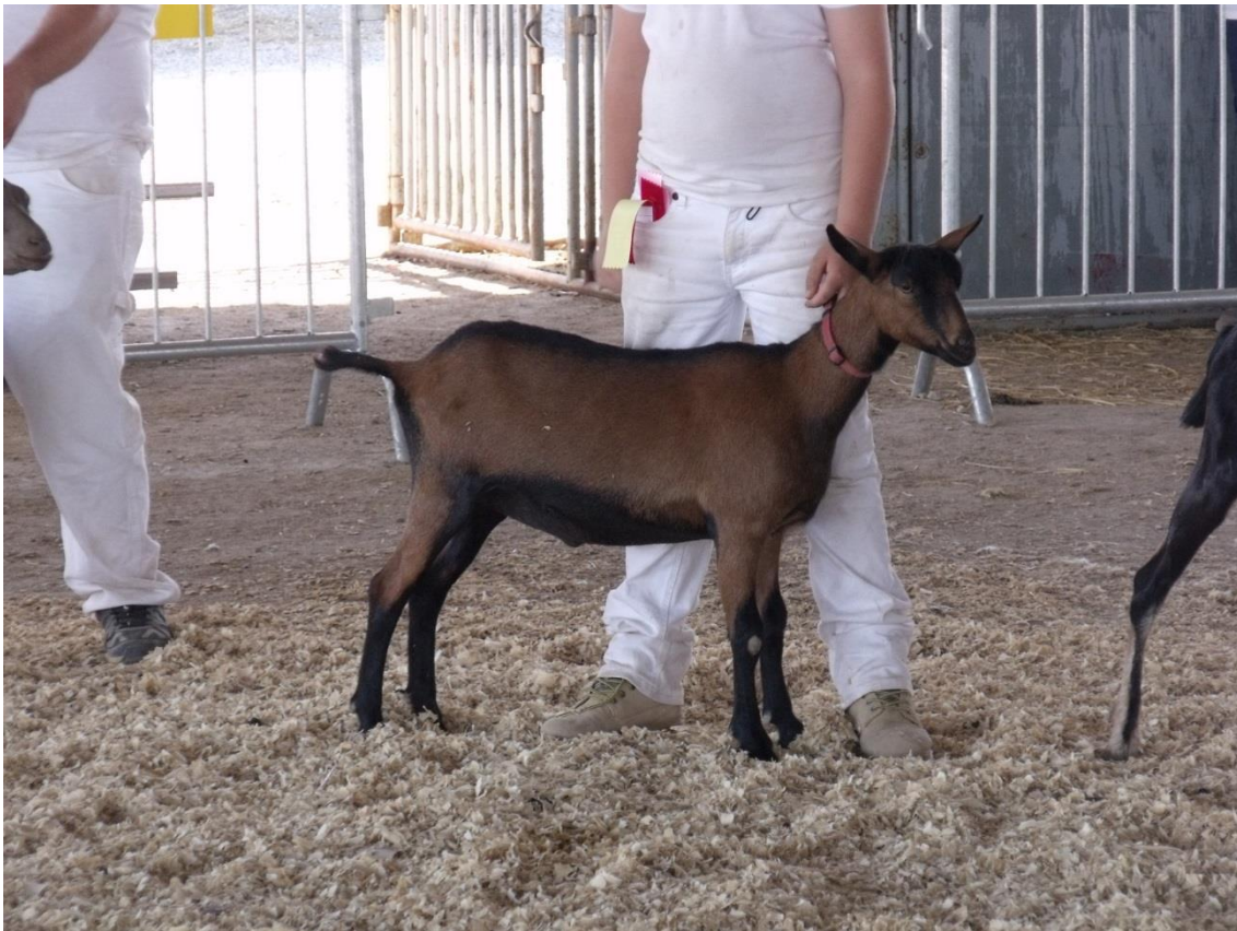
Figure 5. A young Oberhasli goat.

This is a form of Alpine goat, originally from Switzerland. They are known for their distinctive colouring and excellent temperament, along with high milk production.