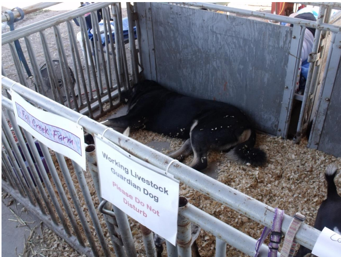
Figure 12. A large Spanish Mastiff sleeping in a pen with young kids.

One of the seminars I wasn't able to attend was regarding LGD's. At first I had no idea what LGD's were but I discovered they were Livestock Guardian Dogs. These dogs protect the goats from predators and are basically full members of the herd. They are introduced to the goats at just a few weeks of age so that the 'imprint' on the animals and the urge to protect is therefore instinctive. Despite their size they tend to be gentle and are often protective of children.