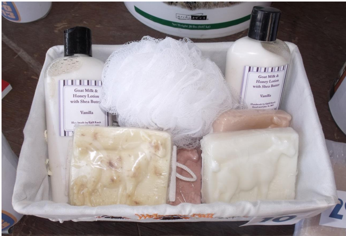
Figure 14. An array of cosmetics made from goats' milk.