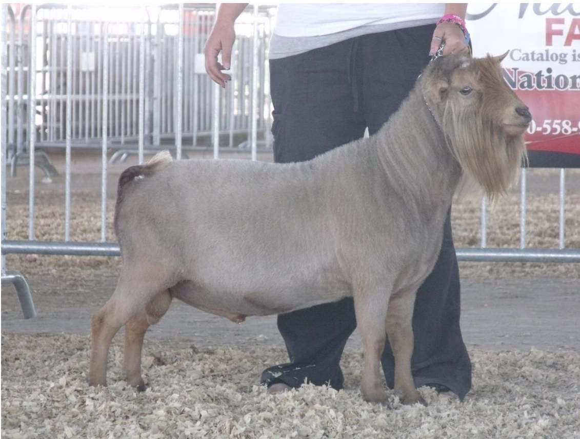
Figure 4. A fine example of a Nigerian Dwarf buck.

As its name would suggest this is a miniature goat breed with West African ancestry. Although short in stature it gives a surprisingly high yield of milk. The milk is also extremely high in butterfat (as much as 10%) and is therefore ideally suited to cheese and soap production.