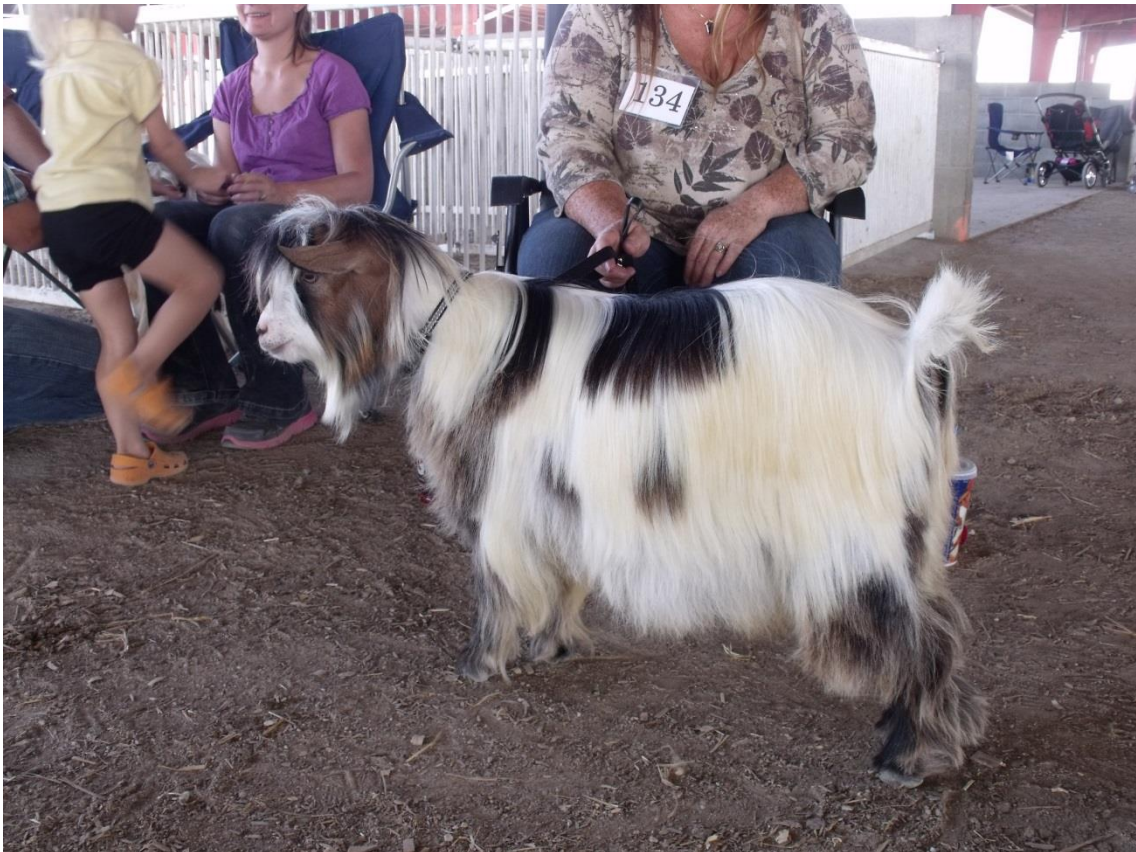
Figure 8. A fully groomed Miniature Silky.

This type of goat is bred for the quality of the coat and its miniature size. It was originally bred from the Tennessee Fainting Goat but other goat breeds have been added such as the Nigerian.