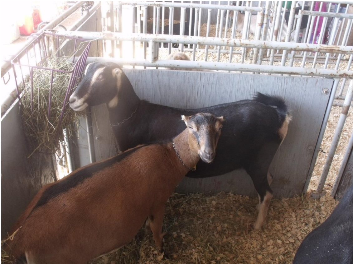
Figure 3. La Mancha goats with easily recognisable ‘elf ears’.

This is a very distinctive dairy breed, easily recognized by their very short ears – ‘elf ears’. They are known for high yield and milk butterfat content.