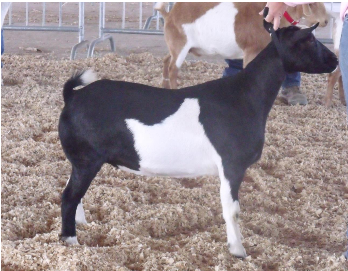
Figure 9. The Myotonic goat is highly suited to meat production, easily recognisable in the conformation of this fine example.

When panicked, the legs of this goat freeze for about 10 seconds so that they are often known as the 'fainting goat'. Its rarity means it can be quite valuable but they were originally bred for meat production (easily understood when you look at the conformation of the animal below).