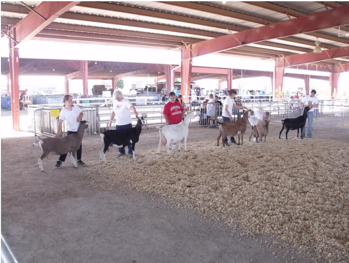
Figure 2. A selection of the dairy breeds present at the show.

There was a large variety of goat breeds present at the Expo. Each of the individual breeds had a number of competitions for different classes and ages of animal. There was also a large number of other competitions including dairy (see photo below), meat, fibre, miniature and myotonic. It was also lovely to watch the 'Pee Wee Showman' competitions, where even very young children are encouraged to show their animals.