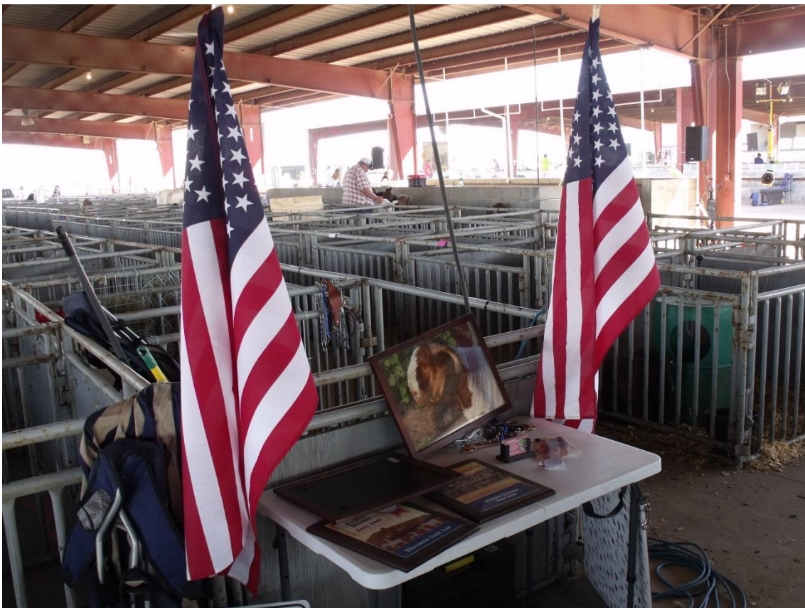
Figure 16. They're patriotic about their goats around here!