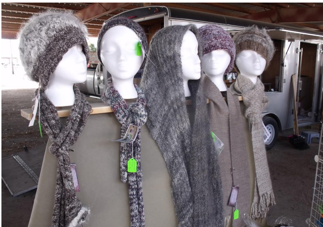
Figure 15. Some of the clothing available made from goats' cashmere.