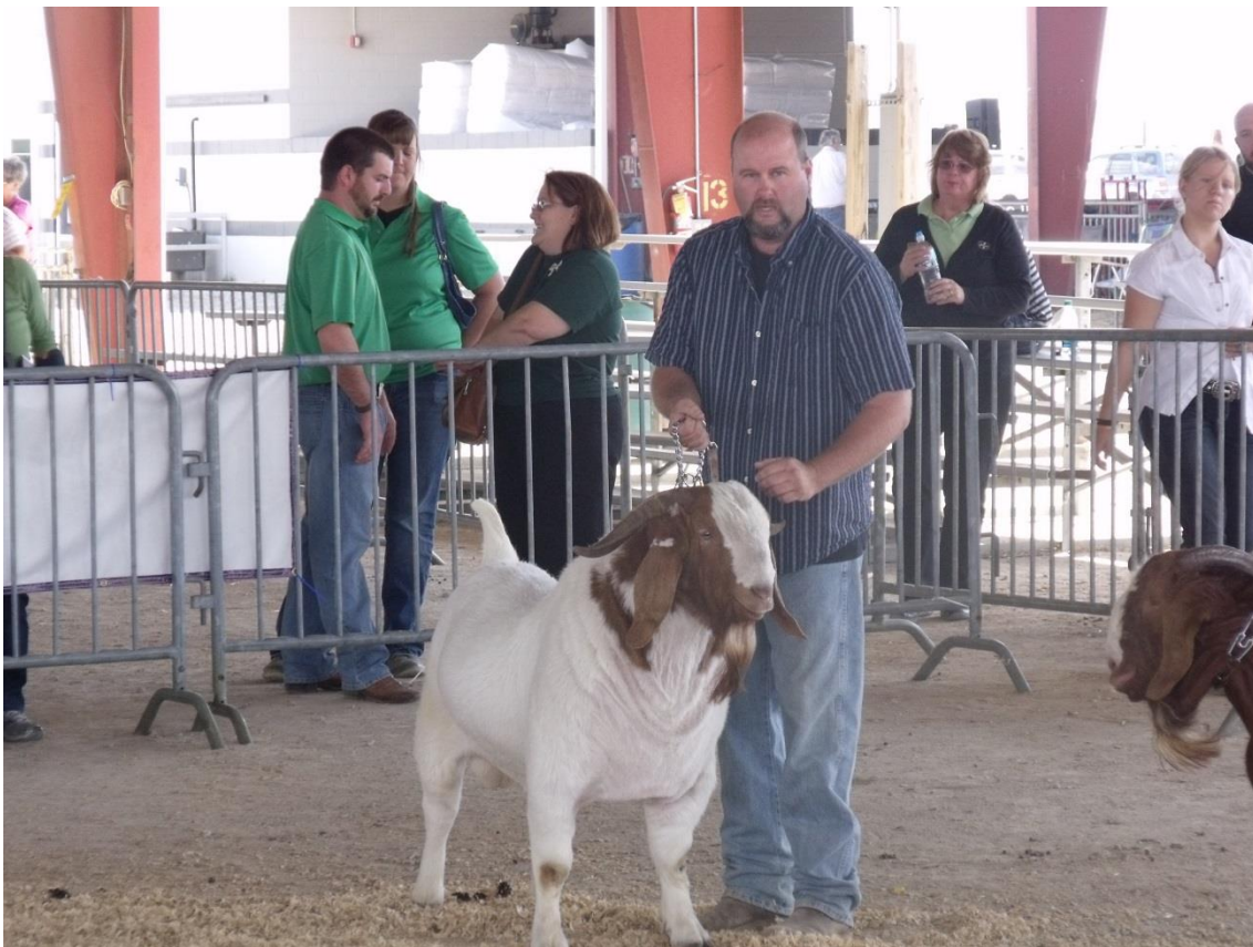
Figure 6. Boer males need a firm hand when being shown. Note the powerful build of the buck.

From the physical stature of this breed it's clear to see that its primary purpose is meat production. Only a handful existed in Ireland up until recently but changes in our ethnic groups and subsequent increase in demand for goat meat has seen a steady increase in recent years. It is originally from South Africa, has a fast growth rate and excellent carcass qualities. This breed had the highest numbers shown at the Expo.