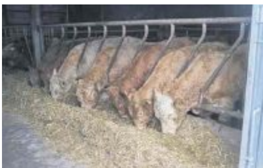
Above left: Weanling bulls from Table 1. Above right: This paddock (pictured last week) was grazed and closed in early October

VIDEO ONLINE watch the video on farmersjournal.tv