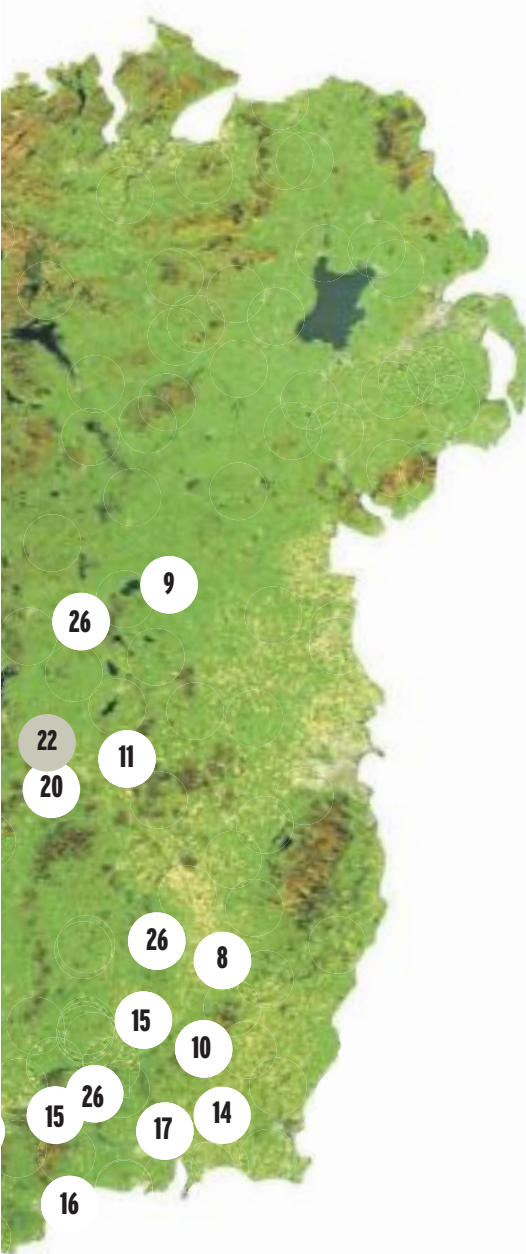
Source: PastureBase Ireland, Agrinet and Irish Farmers Journal.

The on-target cows – at a BCS of 3 to 3.25 – should have full-time access to 64-68% DMD silage and thin cows should be housed along with your springing heifers and fed whatever silage (70% DMD+) your weanlings are on, to appetite. Body condition should be corrected as soon as possible, with animals then going on to a maintenance diet of moderate quality (64-68% DMD) for four to six weeks prior to calving.