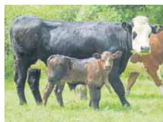
Five-star SA heifer (2yo) with AU calf.