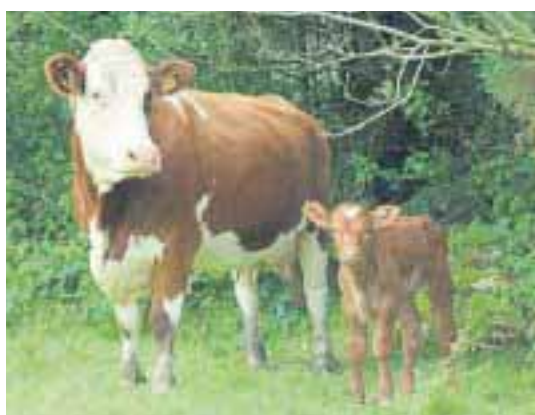
Four-star SI cow with ONI-sired (LM) calf.

"They are coming handy, with just 15 needing a pull. We lost a set of twins, which seemed to be dead quite a while. There was another born dead too - we