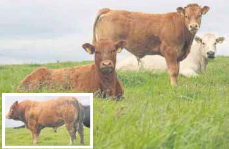
Figure 1 Brian Doran's 200-day weaning efficiency

Brian Doran's spring 2017-born calves, from predominantly first- and second-cross cows. BOX: Brian Doran's stock bull by Haltcliffe Dancer is very strong terminally.