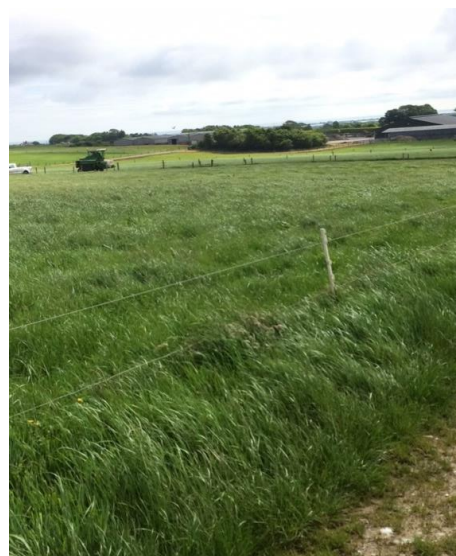
Left: Haldrup taking pre silage cuts on selected representative paddocks.