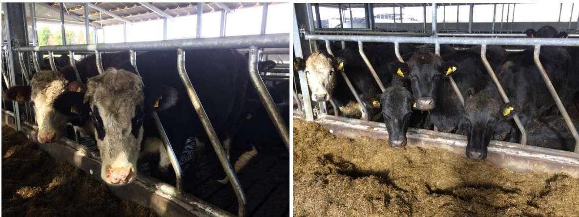
Steers (left) and heifers (right) housed during October in the new shed facilities.