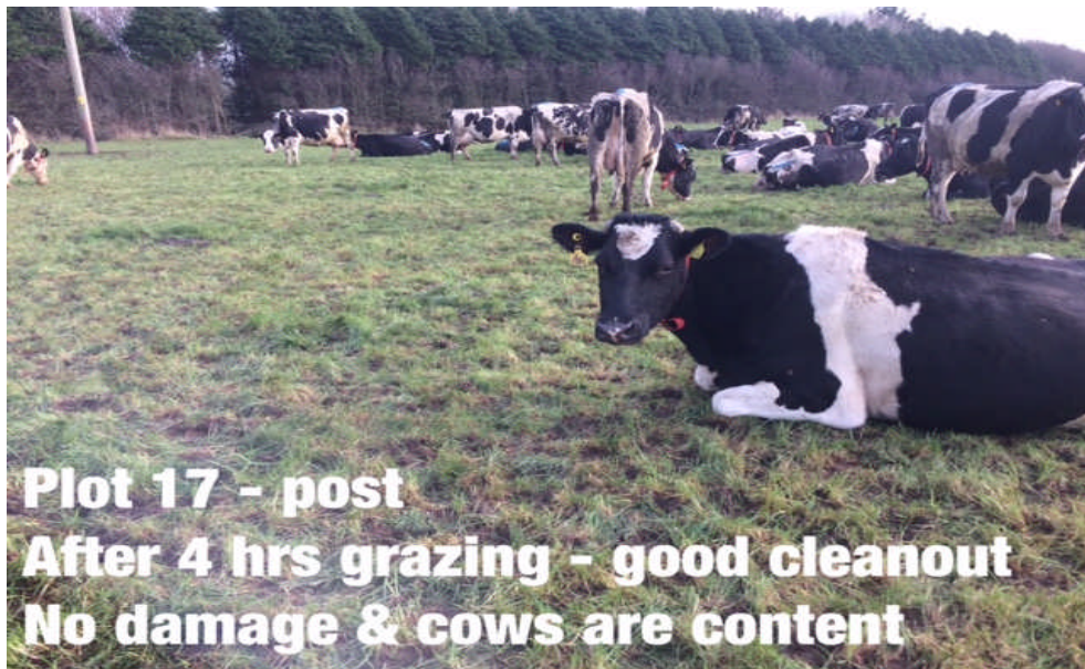
Plot 17 - post After 4 hrs grazing - good cleanout No damage & cows are content