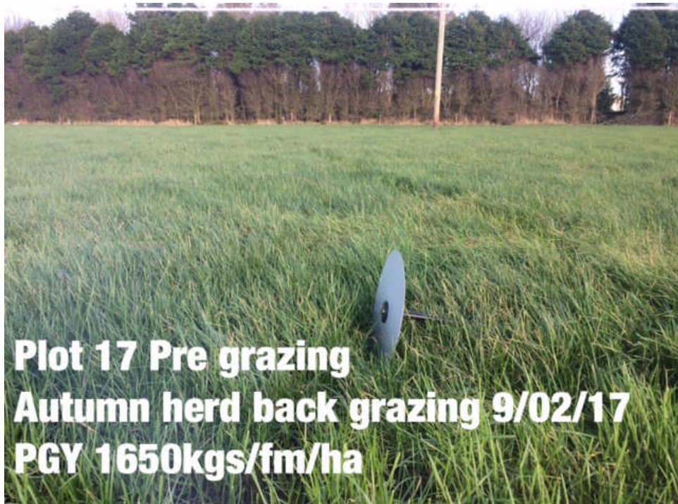
Plot 17 Pre grazing Autumn herd back grazing 9/02/17 PGY 1650kgs/fm/ha