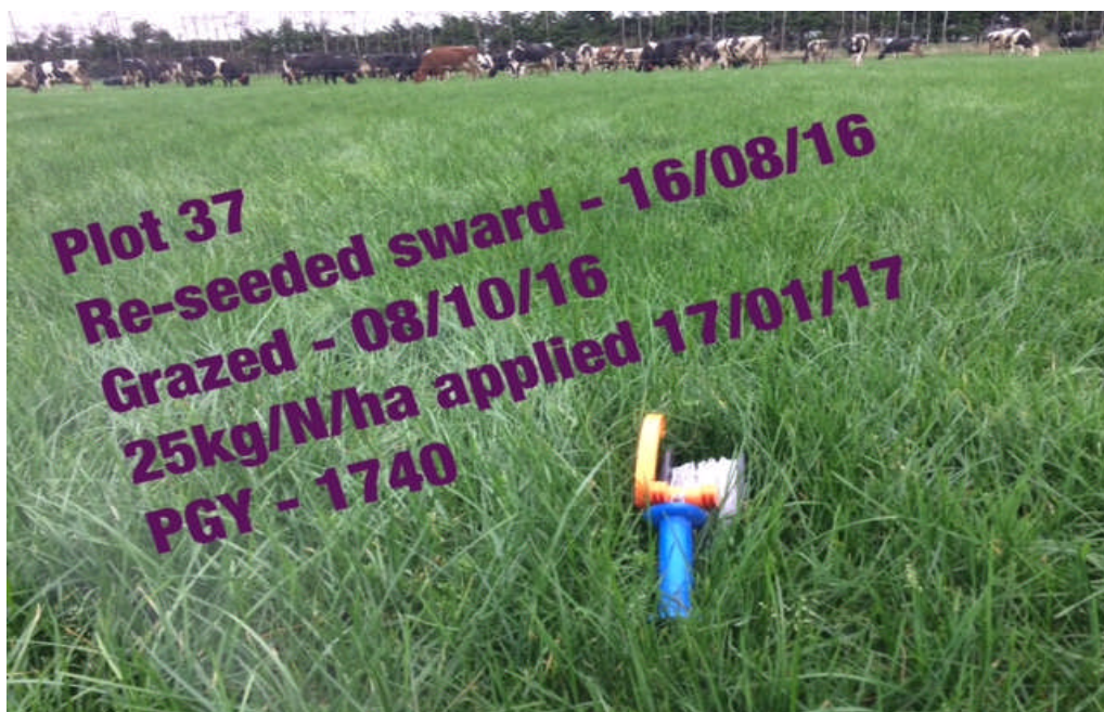
Plot 37 Re-seeded sward - 16/08/16 Grazed - 08/10/16 25kg/N/ha applied 17/01/17 PGY - 1740