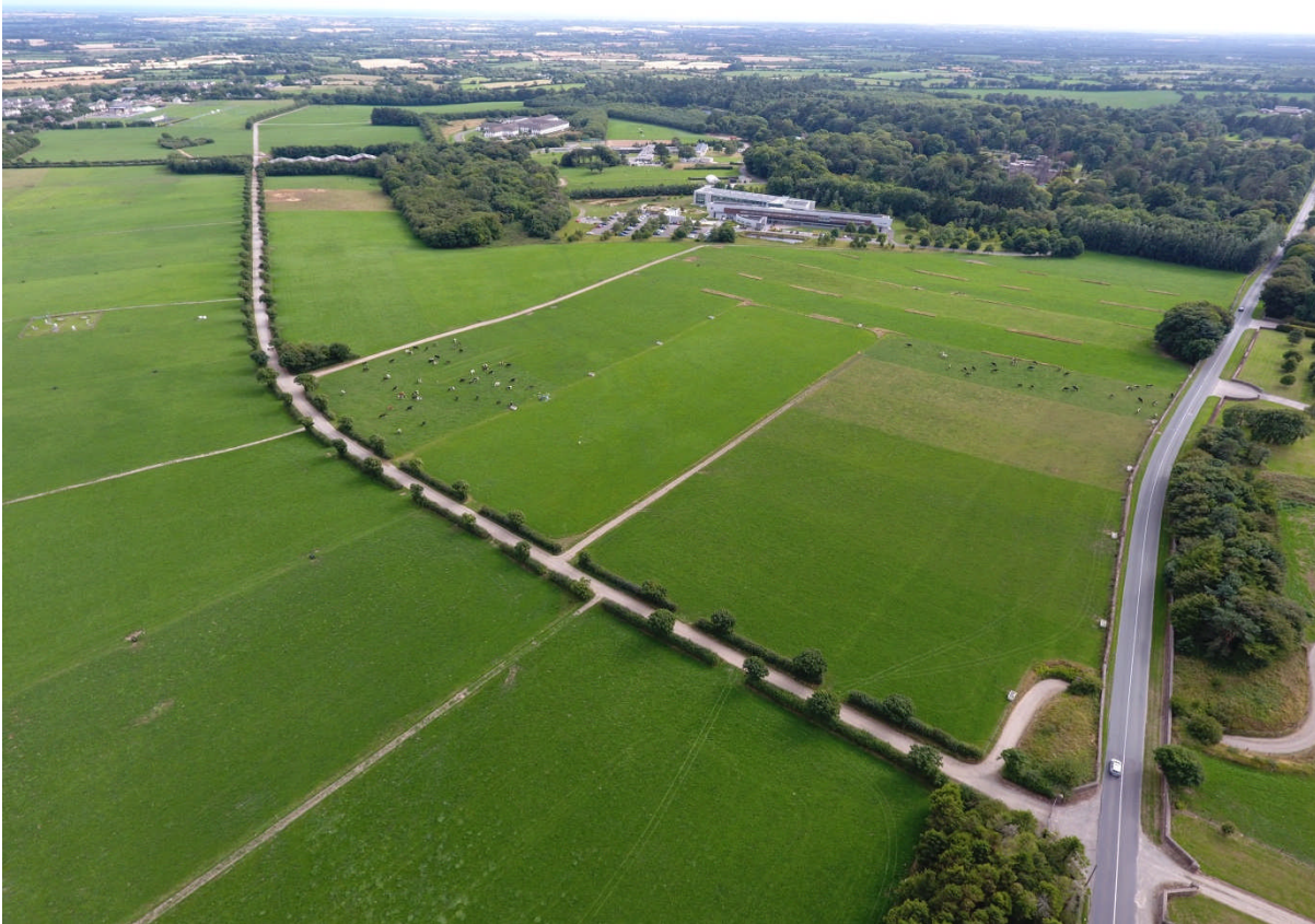
Figure 2 August 8th, Great response to the 50mm rainfall 10 days previous