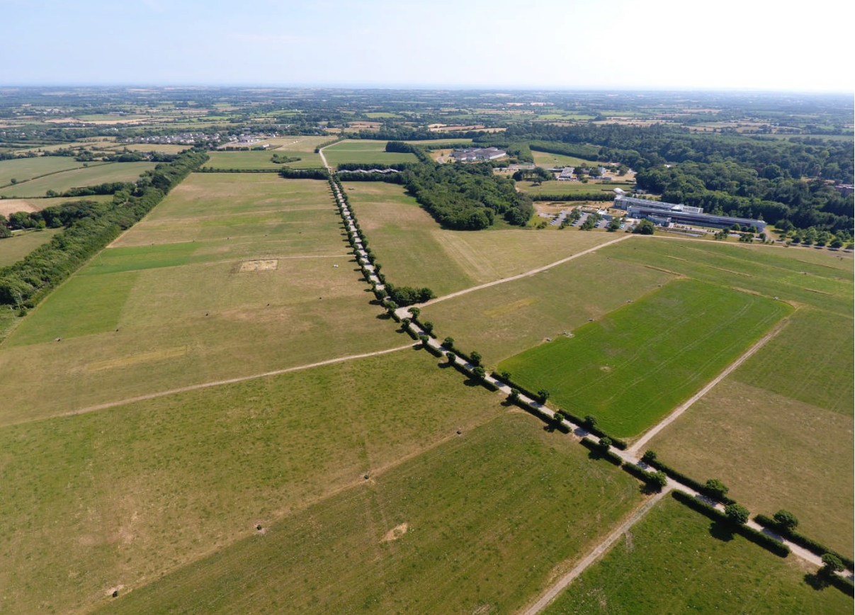
Figure 1 Early July when severe drought was beginning to take