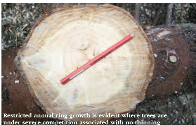
Restricted annual ring growth is evident where trees are under severe competition associated with no thinning

In certain situations, a no thinning regime may be adopted by growers who have concerns about the stability of the crop and the risk of windblow or where poor access and/or tree health compromise thinning viability.