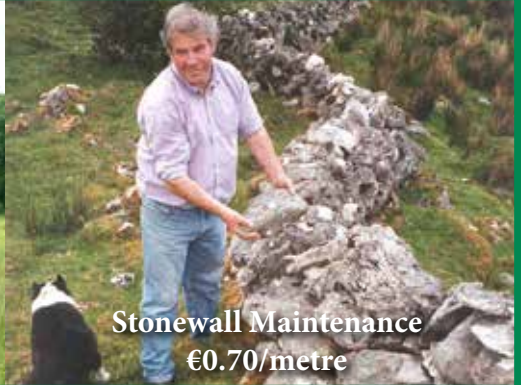
Stonewall Maintenance €0.70/metre