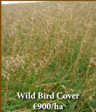
Wild Bird Cover €900/ha