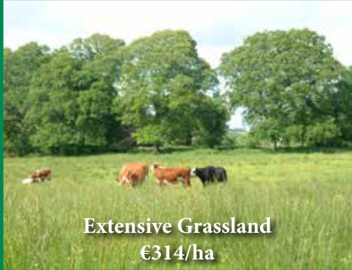
Extensive Grassland €314/ha