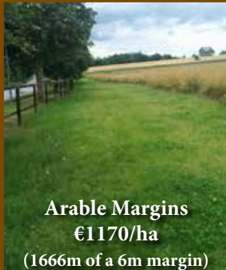
Arable Margins €1170/ha (1666m of a 6m margin)