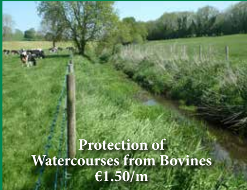
Protection of Watercourses from Bovines €1.50/m