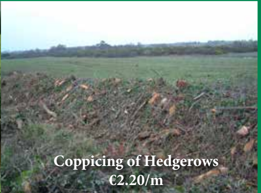
Coppicing of Hedgerows €2.20/m