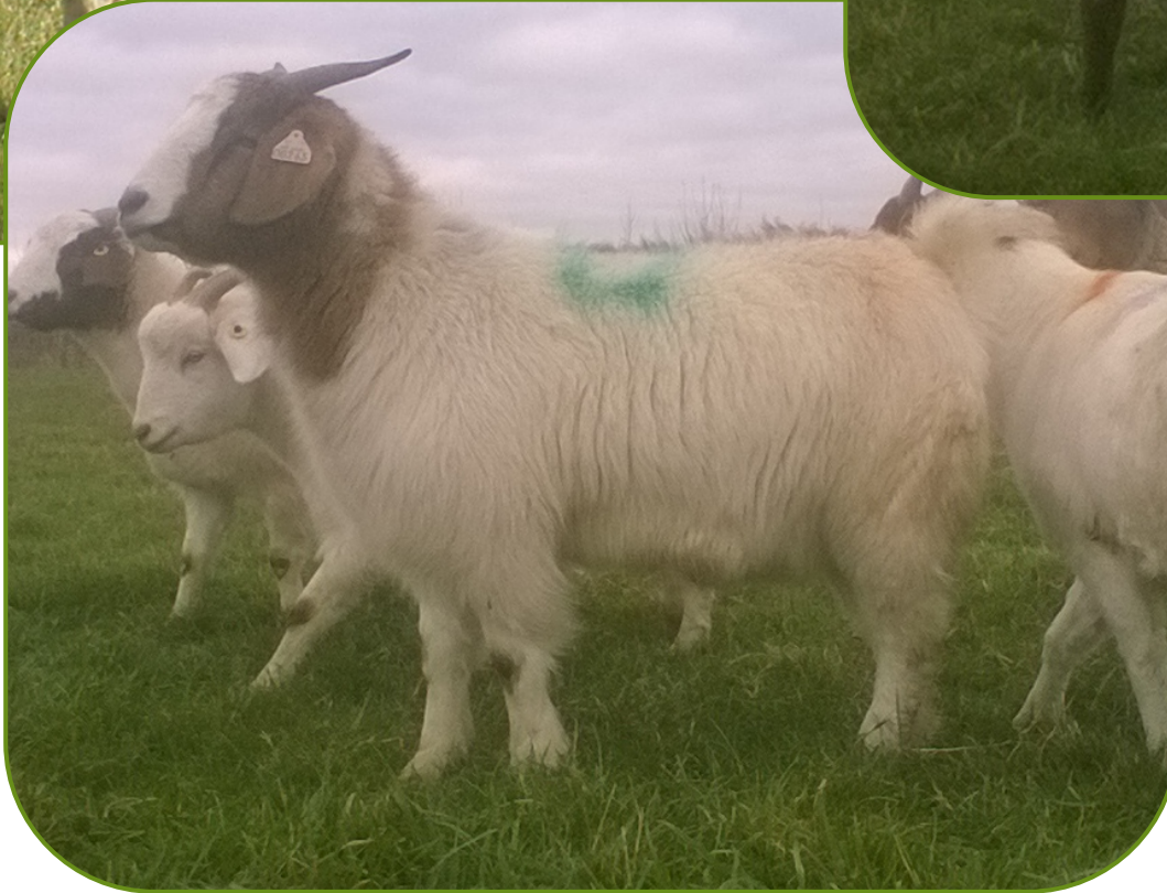
British Meat Goat