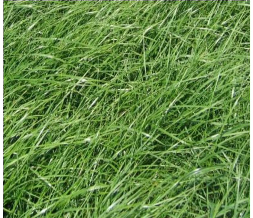
Reseeded sward 13.0t DM/ha