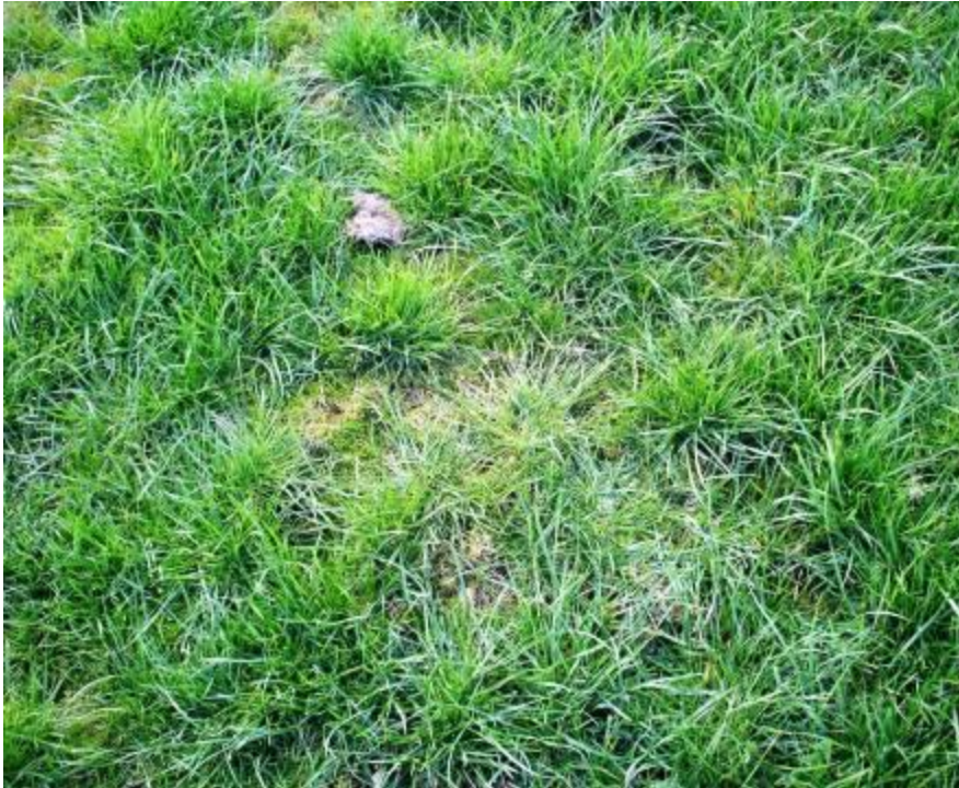
Old permanent Pasture 8.5t DM/ha