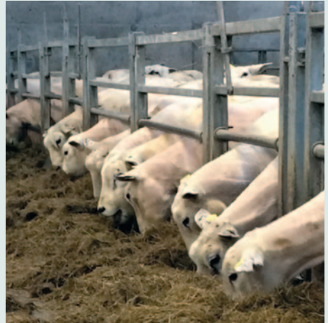
The BETTER farms are keeping a close eye on fodder supplies.

As presented in Table 1 , the lowland farms pregnancy scanned their ewes in late December/January. Overall, scanned litter size was very similar to last year, with a small increase of 0.04 on the average scanned litter size for the group as a whole. While one flock recorded an increase of 0.24 in scanned litter size, litter sizes are on target for most of the flocks, with lower-scanning flocks showing an upward trend. Pregnancy rates were very similar to last year for the group as a whole and while somewhat variable, they are still broadly in line with targets. Some of the farms have scanned yearling ewes, with some still to scan them in the coming days. The farms have also re-assessed what fodder supplies remain to ensure fodder budgets are on target or to take remedial action if necessary to deal with any potential shortfalls.