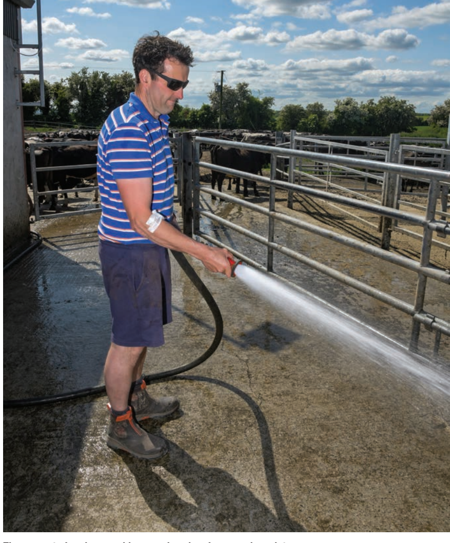
The amount of parlour washings produced on farms varies a lot.

Another possibility is to estimate soiled water production by measur-